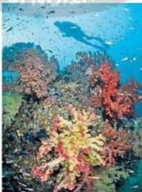
volcanic plugs where air temperatures are a far-from-molten 27C. Eight nights self-board from £3,740pp (two sharing), including flights (02960 849160; aaritsvarkafaris.com)

A few years ago, a bored hotel manager invited me to join him in a conspiratorial game designed to while away dull hosted dinners with guests. The aim was to identify as many instances of one-upmanship as possible: those cringey moments when travellers attempt to trump one another by casually dropping - often unnecessarily - obscure destinations into conversation.