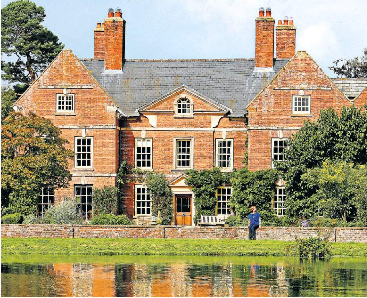
SHANE MCKENNEY FOR THE DAILY TELEGRAPH

Once the ideal option for a cheap (and chintzy) weekend away, now the best properties offer fabulous luxury, says Becky Lucas